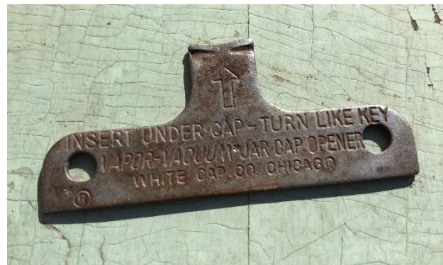
Vapor-Vacuum Jar Cap Opener