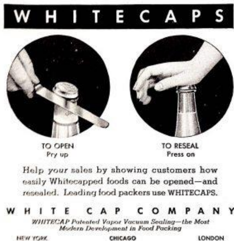
White Cap Ad

https://www.madeinchicagomuseum.com/single-post/white-cap-co/