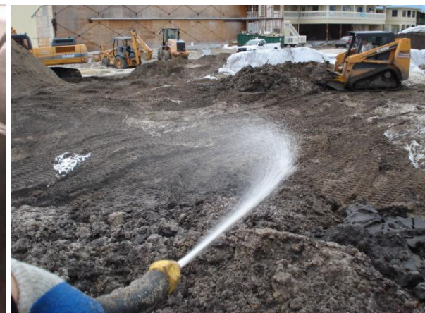
Application of Microorganisms