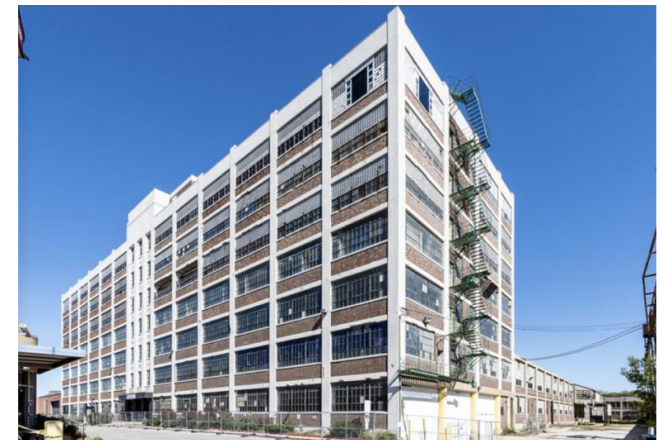
Current Plant Photo