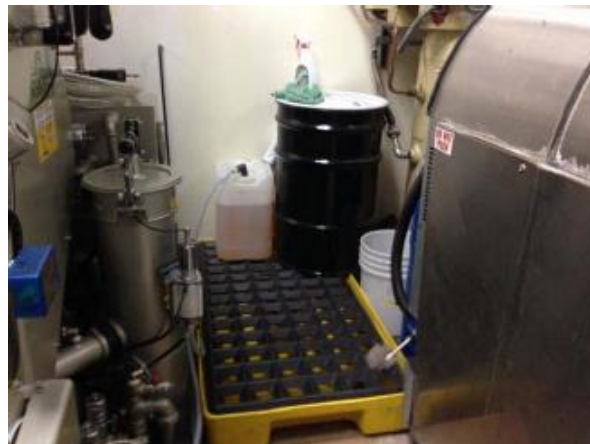
Drums Containing VOCs