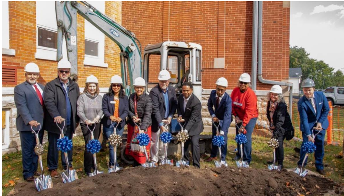
Breaking Ground on a Ground-Breaking Project

https://mcshaneconstruction.com/fox-valley-apartments-affordable-housing-construction/