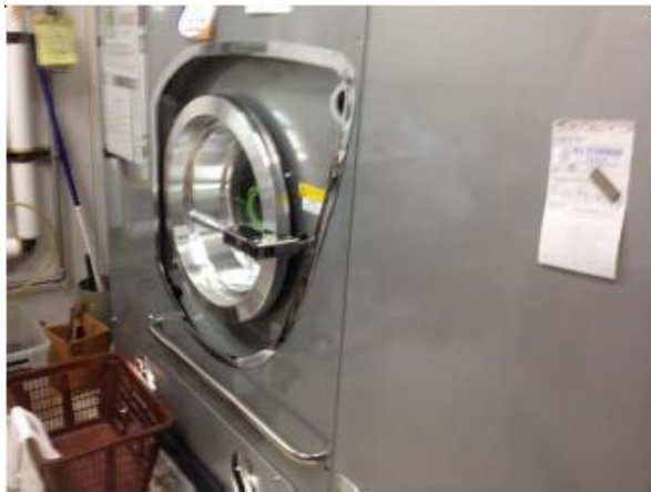
Dry Cleaning Machine

https://cl-solutions.com/photographs-of-field-applications-of-bioaugmentation/